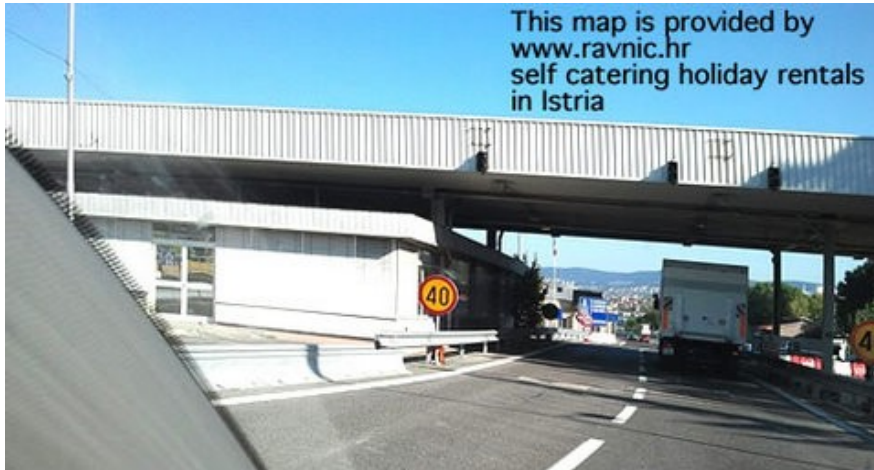
The old border crossing between Slovenia and Italy.